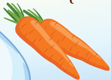
Carrot Nose: $1