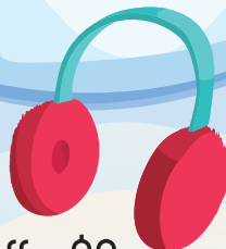
Ear Muffs: $2